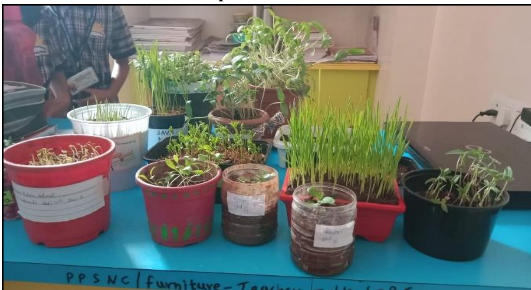
* Activity on Germination