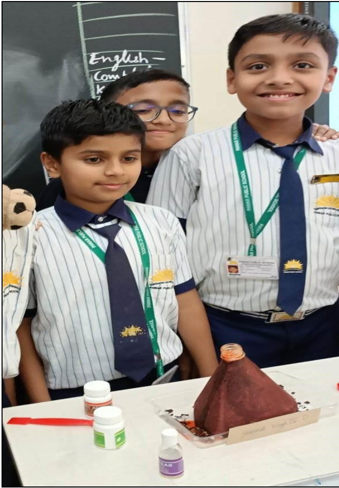
* Working Model of Volcano made by students