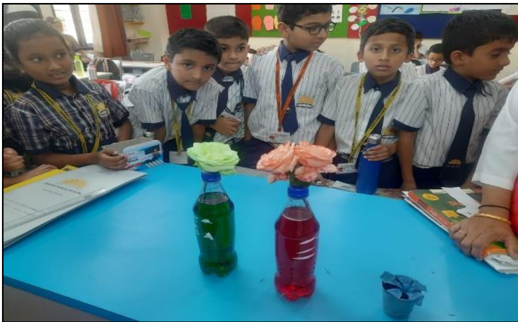
* Hands on Experiment: Stem carries water

Thus, Science day was celebrated through-out the year and not only on a particular day in the true spirit of cultivating Scientific Attitude as per the National Educational Policy 2020. And we hope to continue this in the future.