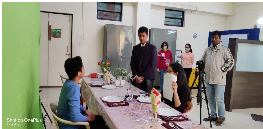
Shooting of TV Show (Local Food) at School Pantry

The 'On Stage' Project had six sub-projects – Local Sports, Local Food, Local Music, Local Festivals, Wildlife and Nature, and Classroom in School Culture. This project was quite different from 'Go Green 2 Project'. The project team members created a recorded TV Show of about 5-10 minutes with a lot of humour. The interesting part of the project was that the students had to research on the partner school's country and present the TV Shows based on that. Students and teachers put a lot of interest and effort to understand the culture of the partner country. Our partner school for this project was Hervormd Lyceum Zuid from Amsterdam, Netherlands. This project helped in developing deep appreciation for the culture of the partner country among all the students and teachers involved.