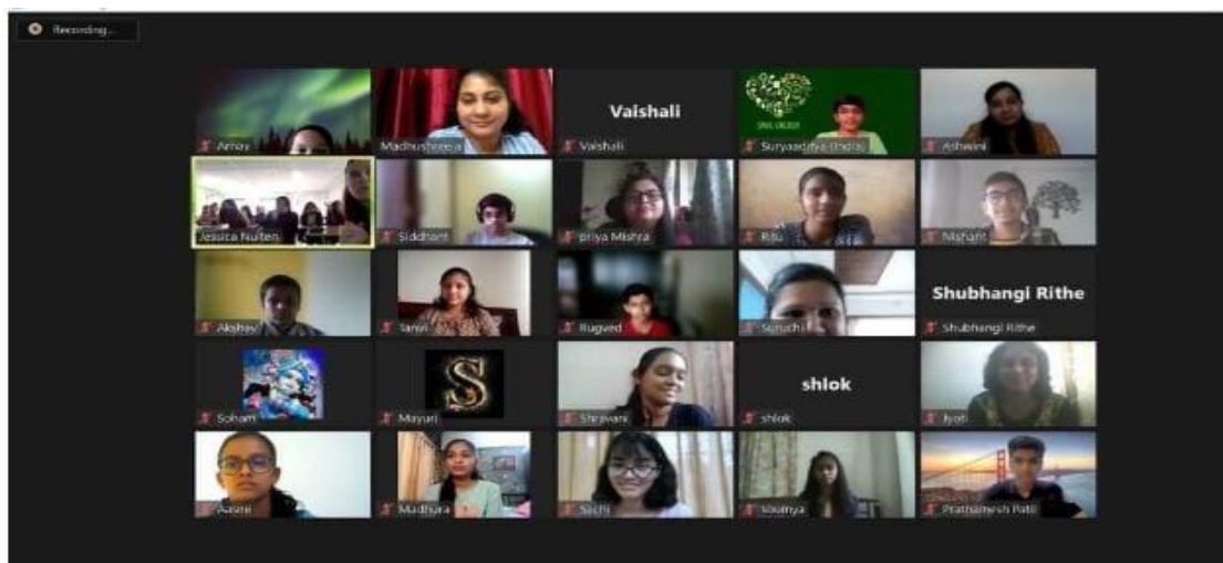
Go Green 2 – Video Conference

Both the EUMIND projects – ‘Go Green 2’ and ‘On Stage’ left an indelible positive effect on the minds of the students. They learned about the culture of their partner country, got the opportunity to collaborate on a cross-geography project, and picked up life lessons which no amount of class lessons could provide.