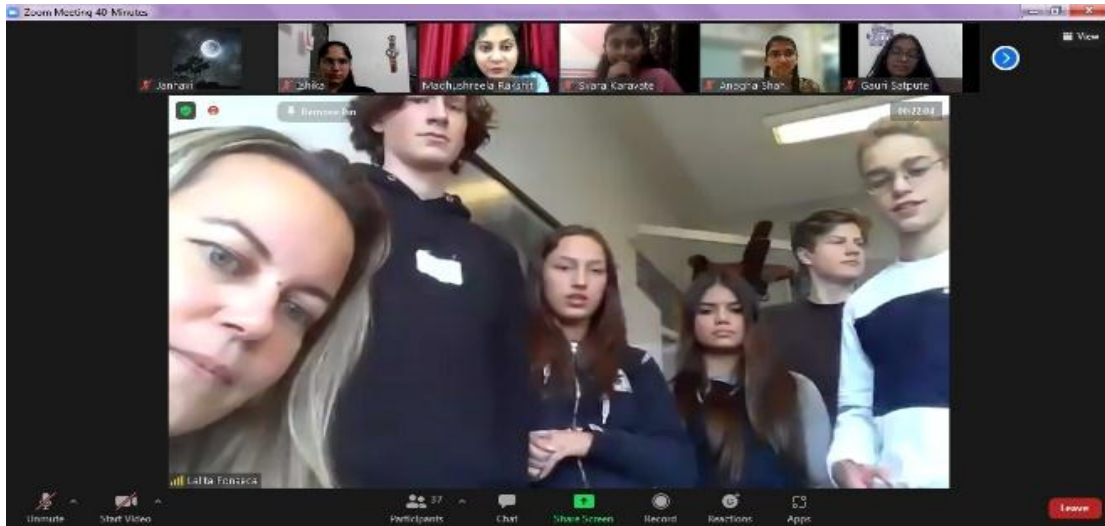
On Stage Project – Video Conference