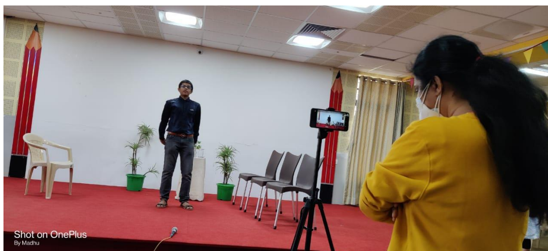
Shooting of TV Show (Local Music) at School AV Hall

Both the groups were very enthusiastic and contributed significantly to every part of the projects. The best part of the projects was the Virtual Video Conferences with partner schools. Students and teachers had an unforgettable experience interacting with the students and teachers, which helped them to know about each other in a better way before they started with their respective assignments. They were in constant touch with each other via whatsapp groups and video calls.