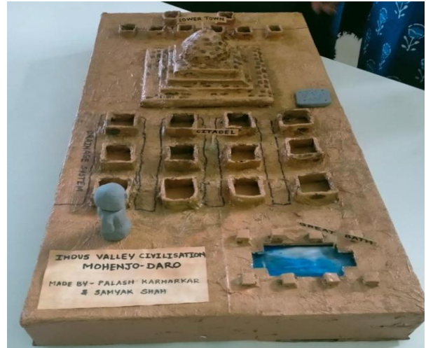
Model making – Mohenjo Daro