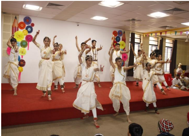
Bharatnatyam dance - Nrityavigyaan