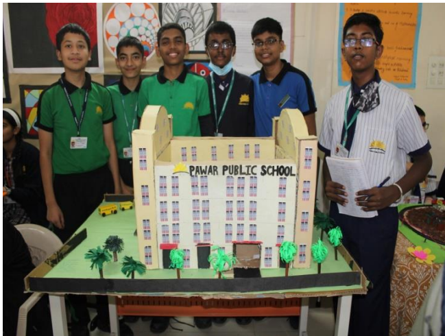
Model making – Pawar Public School