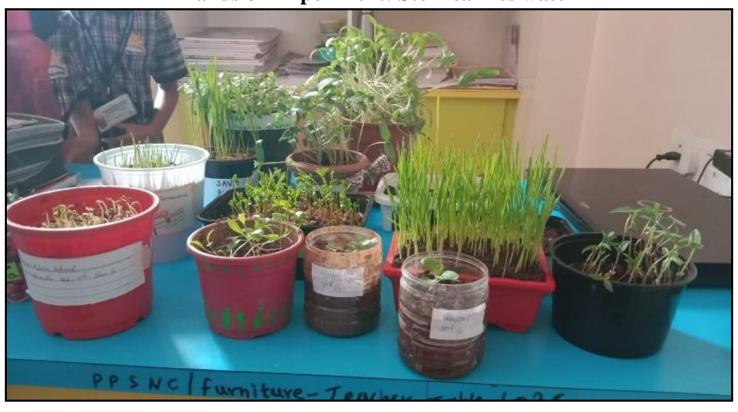
* Activity on Germination