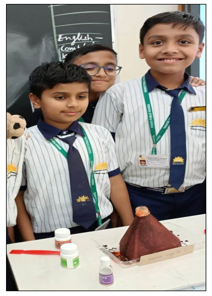
* Working Model of Volcano made by students